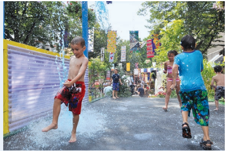
Central Pennsylvania Festival of the Arts, held every year in downtown State College

Living and working in State College gives you an added sense of flexibility. When home, work, and your child's daycare or school are all within a short distance, you're available if need be. With less travel, you can quickly make it home from work for family time.