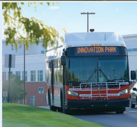
GREAT STARTUPS MORE THAN GREAT SCIENCE Page 7