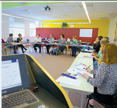
THE HISTORY OF INNOVATION Page 4