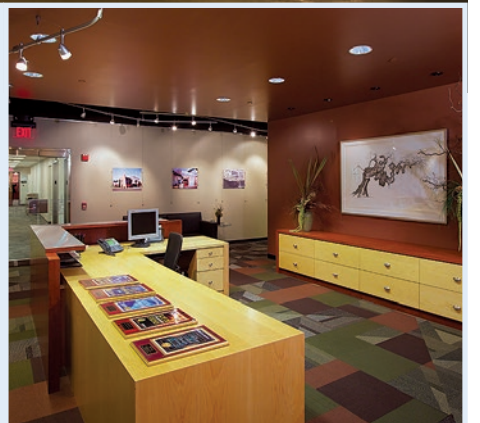
ENGINEERS BY DAY, ROCKSTARS BY NIGHT Page 13