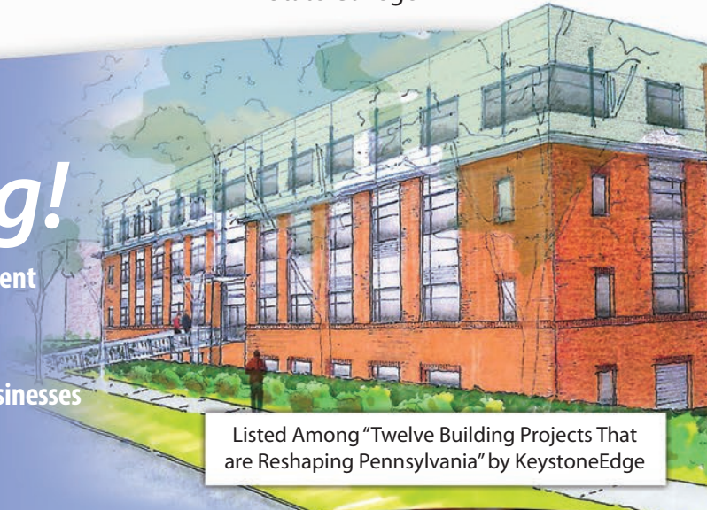
Listed Among "Twelve Building Projects That are Reshaping Pennsylvania" by KeystoneEdge