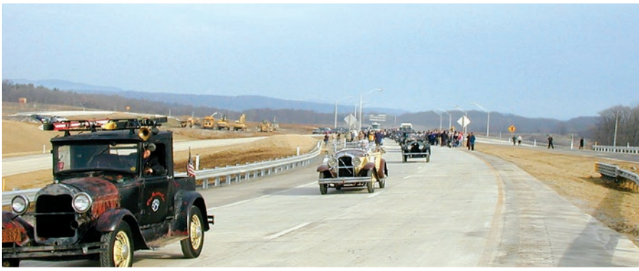
Antique cars at the I-99 ribbon-cutting ceremony: 2002