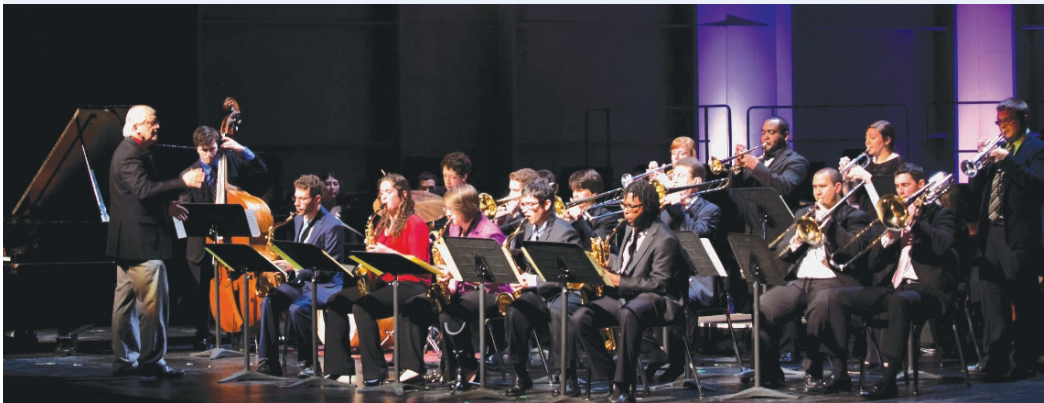
Penn State's Center for Performing Arts

State College, or Happy Valley as it's more affectionately called, truly offers the top-notch quality of life you're looking for. We've received numerous national awards for our small town atmosphere, sense of community, and connection to world-class research facilities at Penn State. Happy Valley is the place where work and personal life are priorities, and both are richly rewarding.