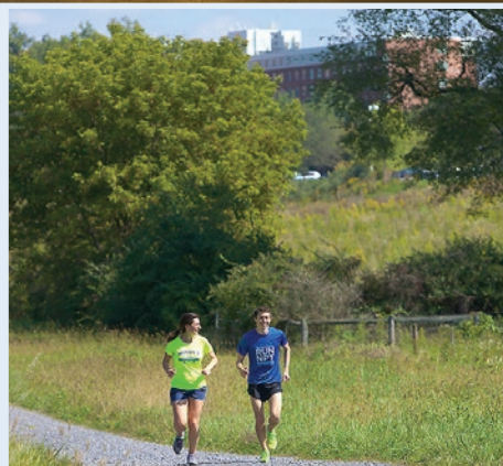
LOCATION, LOCATION, LOCATION Page 10