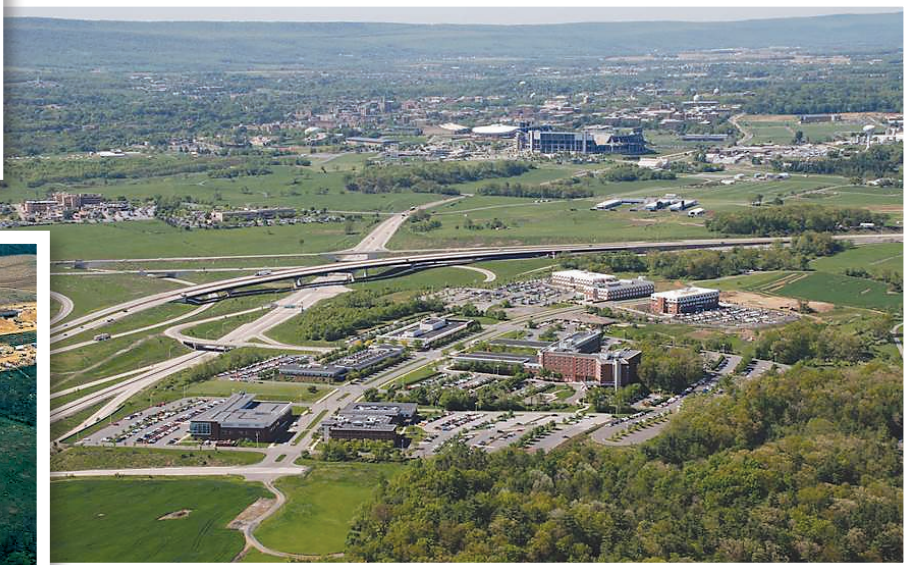
Innovation Park: 2009