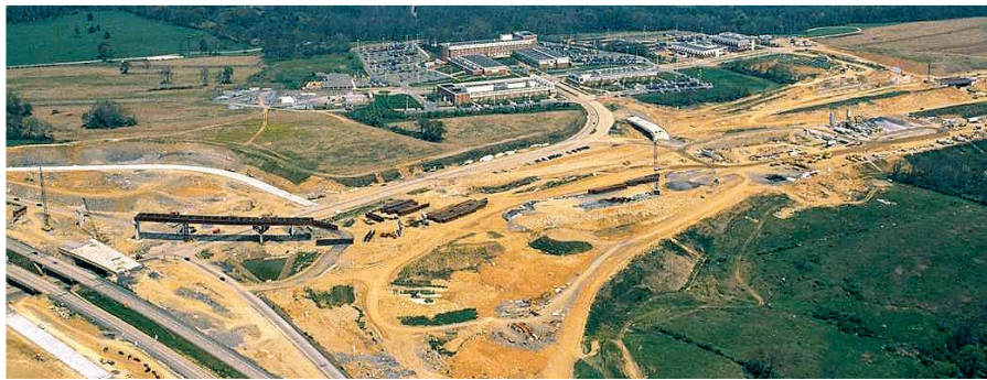
Innovation Park: 2001