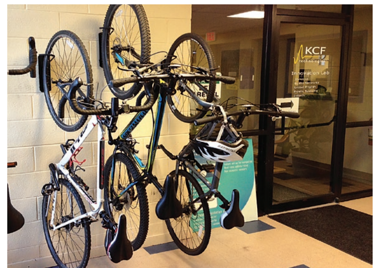
Bike racks hang outside the KCF office.

Not to mention, he adds, KCF is just a 3-6 hour drive from key mid-Atlantic and East Coast manufacturing hubs. "From here, we have an incredibly wide reach: Pittsburgh, Philadelphia, DC, Wilkes-Barre-Scranton, Baltimore, Cleveland, Buffalo... they're all in a doable driving distance, which is critical for selling and implementing a system that monitors machines."