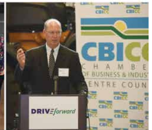
STATE COLLEGE TO HOST TOWN & GOWN CONFERENCE PAGE 13