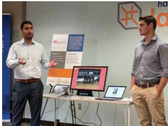
The Moichor Team