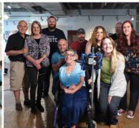
WOMEN-OWNED BUSINESSES PAGE 9