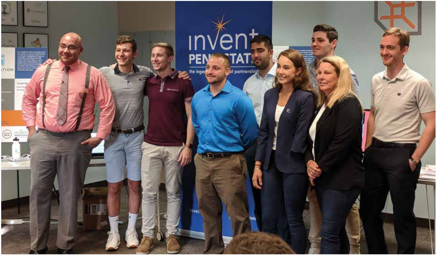
Entrepreneurs demoed their ventures to members of the public at the Summer Founders Program Demo Day at the Happy Valley Launchbox.