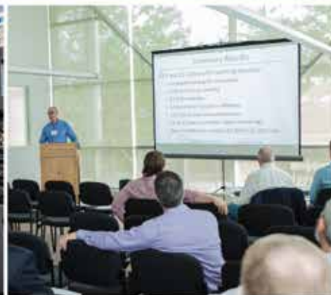
FROM CONCEPT TO COMMERCIALIZATION PAGE 7