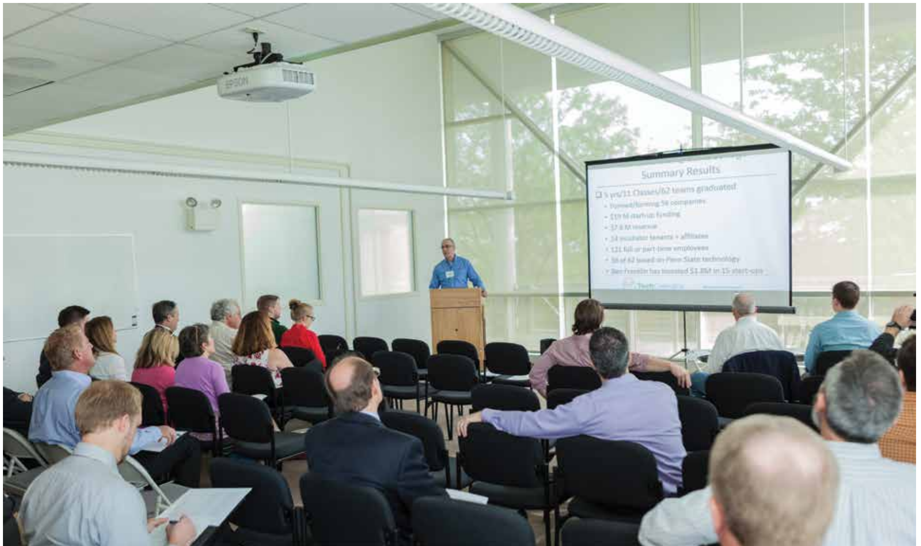
In the 26 years since its founding, the Technology Center at Innovation Park has helped hundreds of budding businesses.