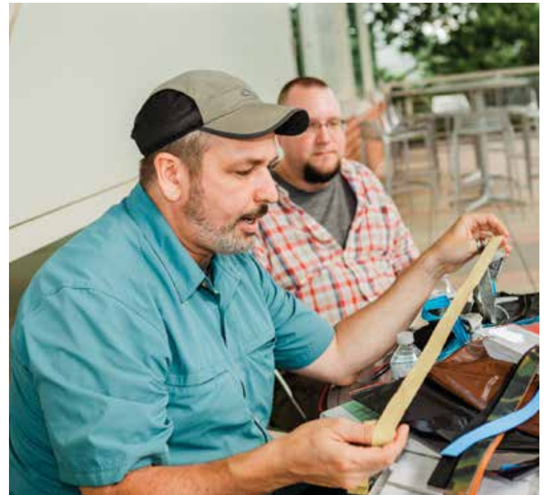
Dutch’s creations are versatile and lightweight.

Creating hardware for hammocks has been Dutch’s true passion. He began manufacturing the Dutch Clip, which he invented to connect the webbing suspension around the tree. Next was the Dutch Biner, a 10-gram carabiner that connects the whoopie sling, a light and adjustable suspension, to a steel loop, followed by the Dutch Flyz, a no-knot, quick-connection device for hammock tarps.