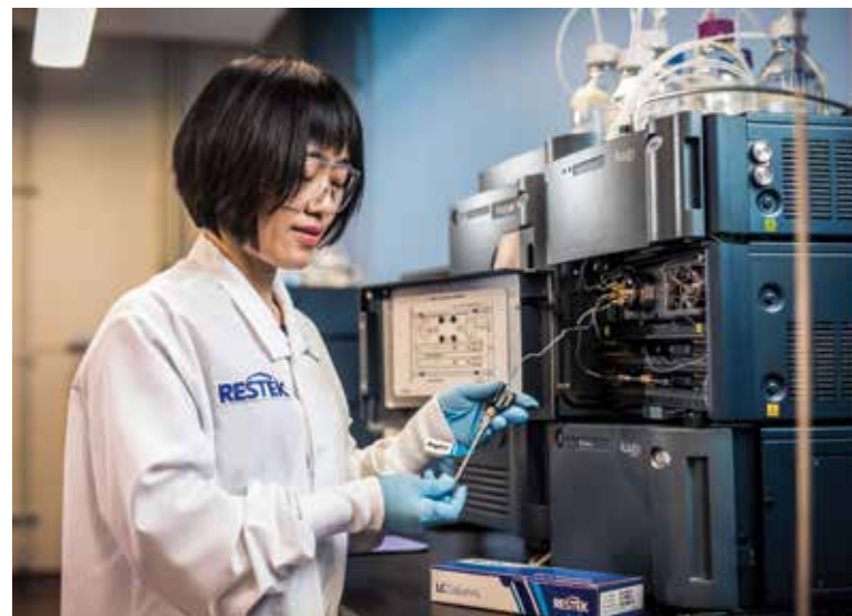
Restek scientists are world leaders in chromatography.

Presently, chromatography is widely used—and in increasing demand—by analysts around the