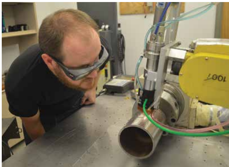
Nittany Laser was founded in 2012 to provide a wide range of laser processing tools and services.

When asked about his favorite part of living and working in Happy Valley, he pointed out that it was the best of both worlds. “It’s a small town that has lots of diversity because of the university, but without the headaches of a big city.”